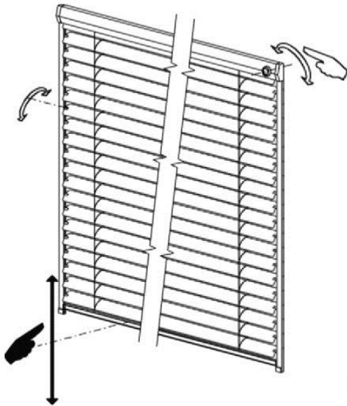
control of the accessible blind